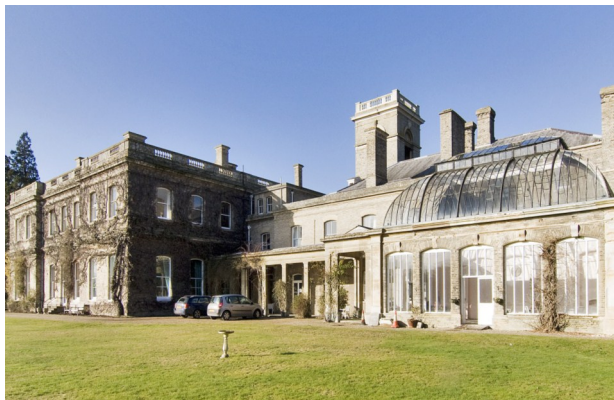
Stowlangtoft Hall—The Centrepiece of the Estate