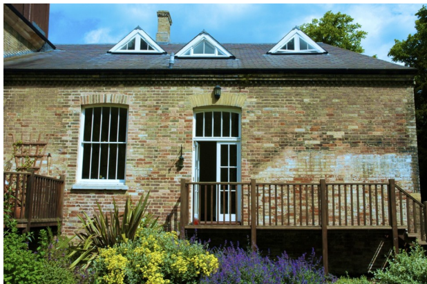
Amherst House — 5 Star Holiday Accommodation